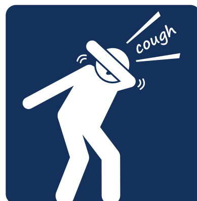
COVER COUGHS & SNEEZES