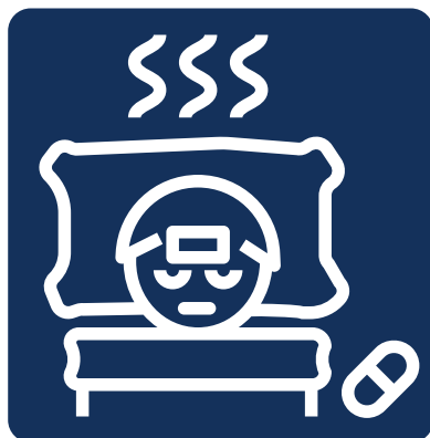
STAY HOME IF YOU'RE SICK