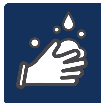
WASH HANDS FREQUENTLY