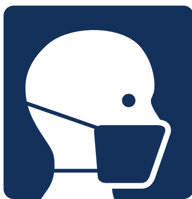
WEAR THE REQUIRED PPE