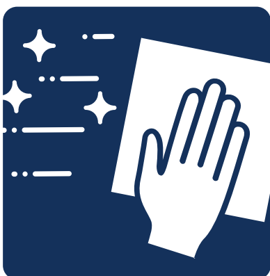
DISINFECT ALL SURFACES