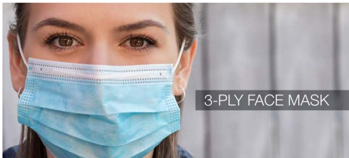
3-PLY FACE MASK

The Disposable 3-Ply Face Mask is composed of 3 ply fabric. Above 95% BFE (Bacterial Filtration Efficiency). $1.50 each for 300 units / $1.39 each for 1000 units